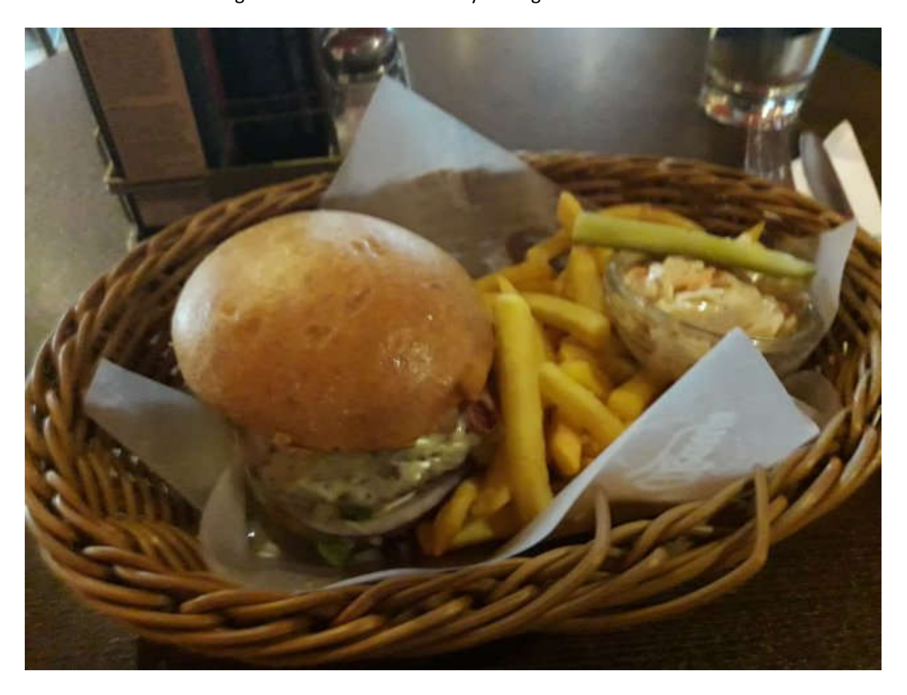
A fantastic burger with blue cheese!

2 o'clock in Helsinki. Where can we find food? Everywhere. Food that isn't expensive? Nowhere. So we settle for the 20€ burgers and salads. At least they taste great.