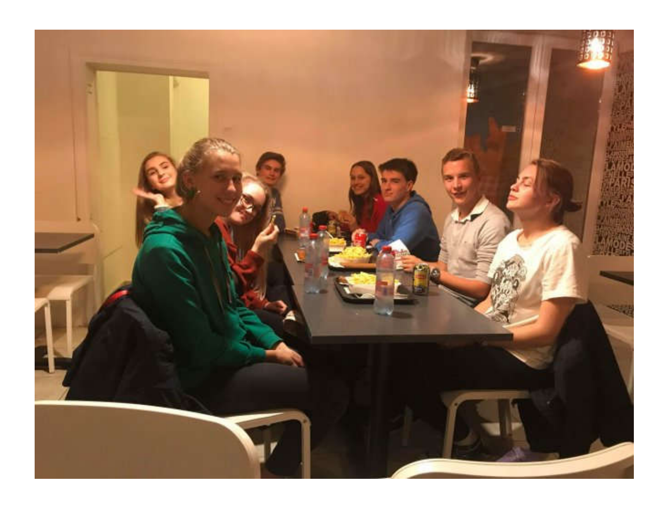
Day 2: To each their own